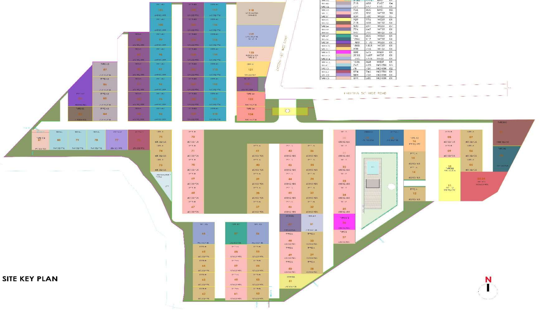
SITE KEY PLAN