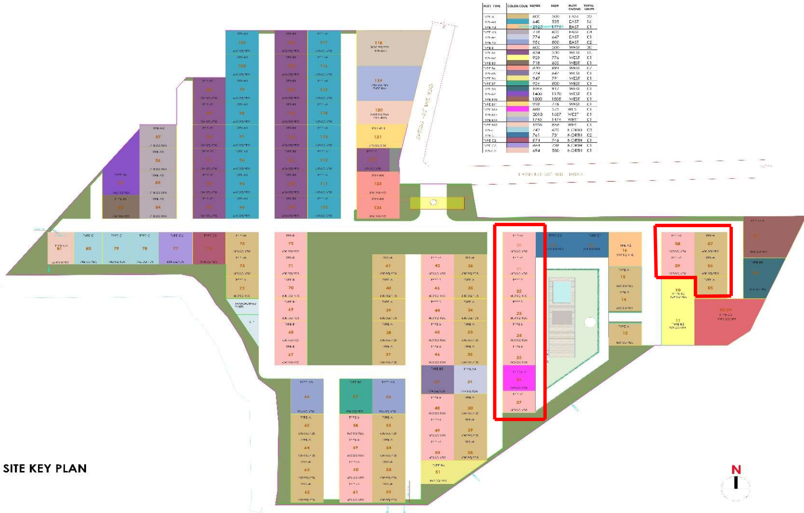
SITE KEY PLAN