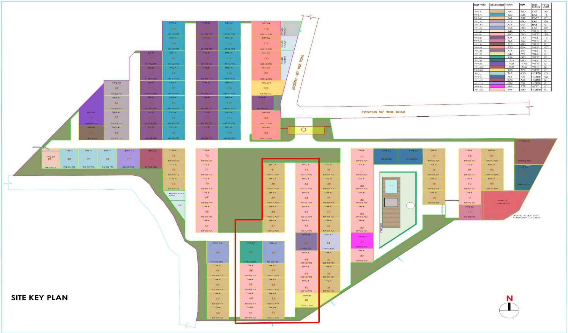
SITE KEY PLAN