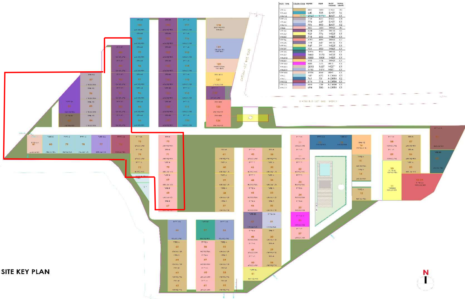
SITE KEY PLAN