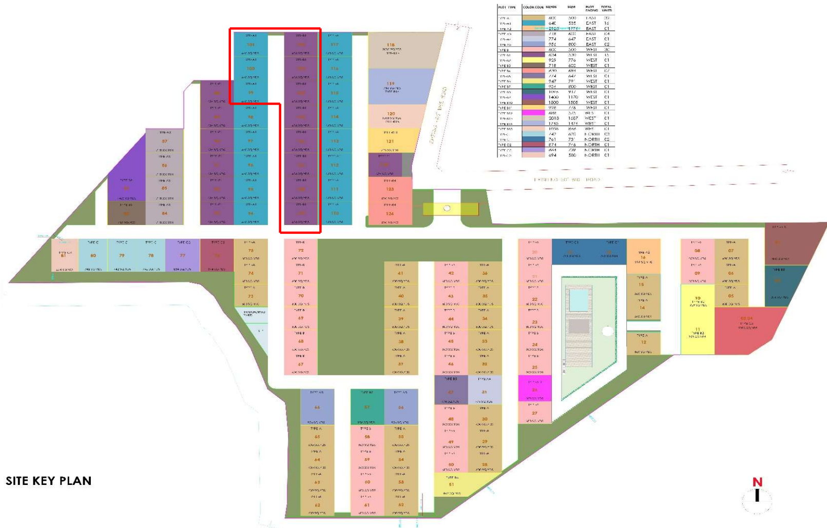
SITE KEY PLAN